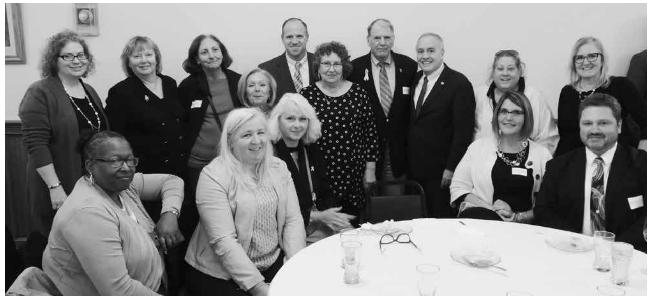
BTF members pose with state and local representatives

Awards range from $1000-$6000. The application process opens on January 1st and closes April 1st. To apply, visit www.cfgb.org and click on the For Scholarships tab. You also may call the CFGB at 852-2857.