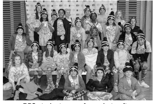
BPS students pose for a photo after participating in the WNY Girls in Sports Event.

All schools are welcome to participate in this event, so be on the lookout for information coming on the spring event!